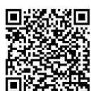
Ladder Installation Manual