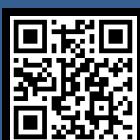
TileLink Installation Video

Product Sheet: LADER001.06 Version 07.16