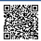
Ladder Installation Manual